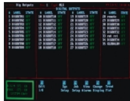
Digital Output screen

The screen can be used to view the current digital output settings status and to force an output on or off. It is also a useful tool for testing or troubleshooting.