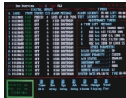
Digital Input screen

This digital input screen shows the status of each input, the type of alarm programmed for each input and the alarm message can be displayed. Maintenance timers are also viewed and set from this screen.